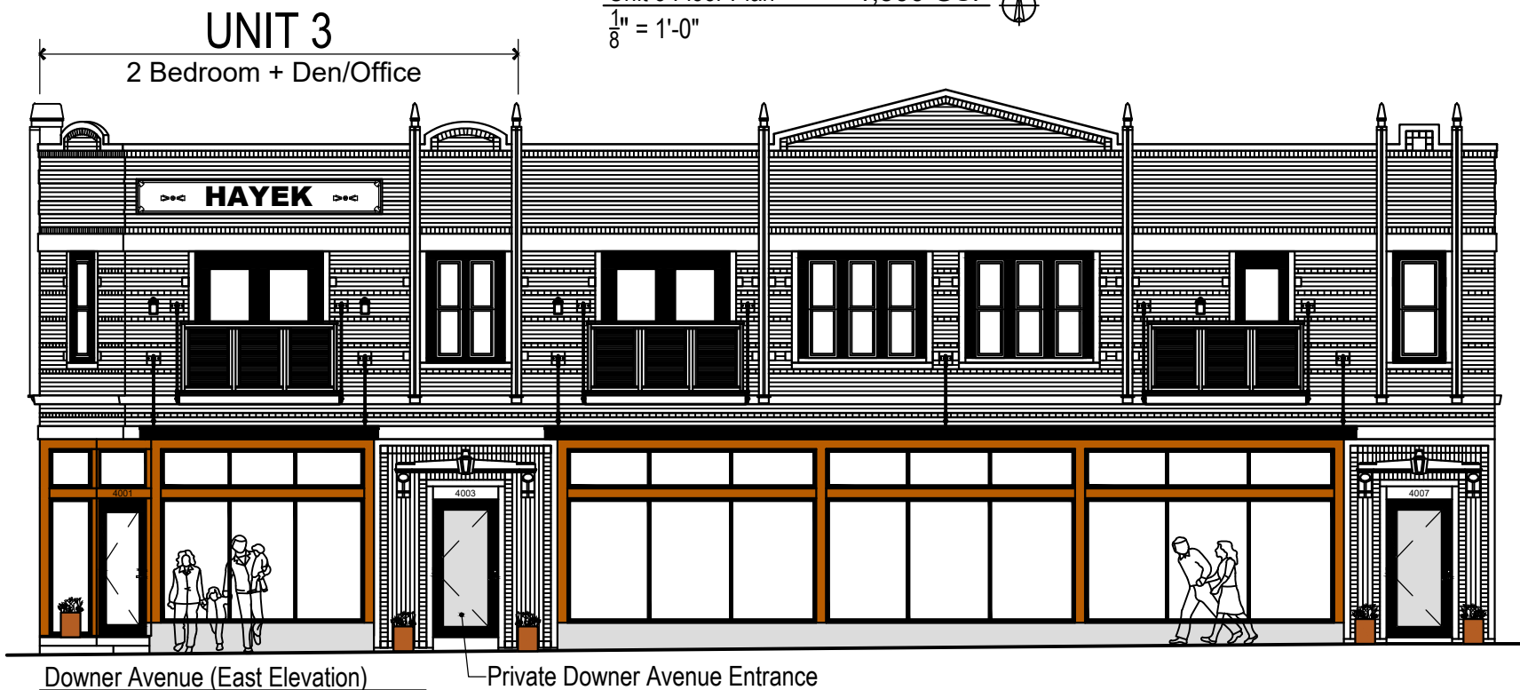
Downer Avenue (East Elevation)