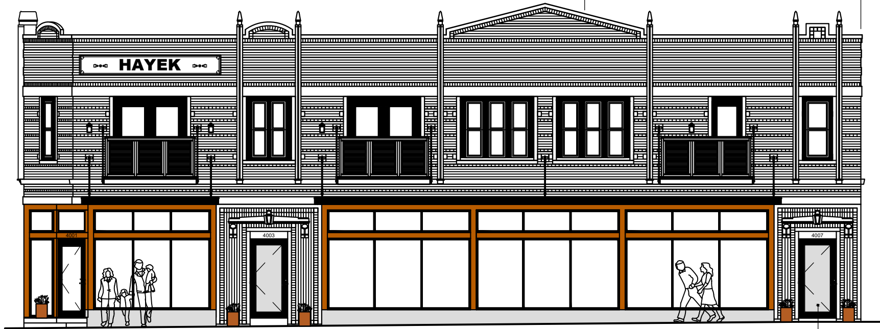
Downer Avenue (East Elevation)