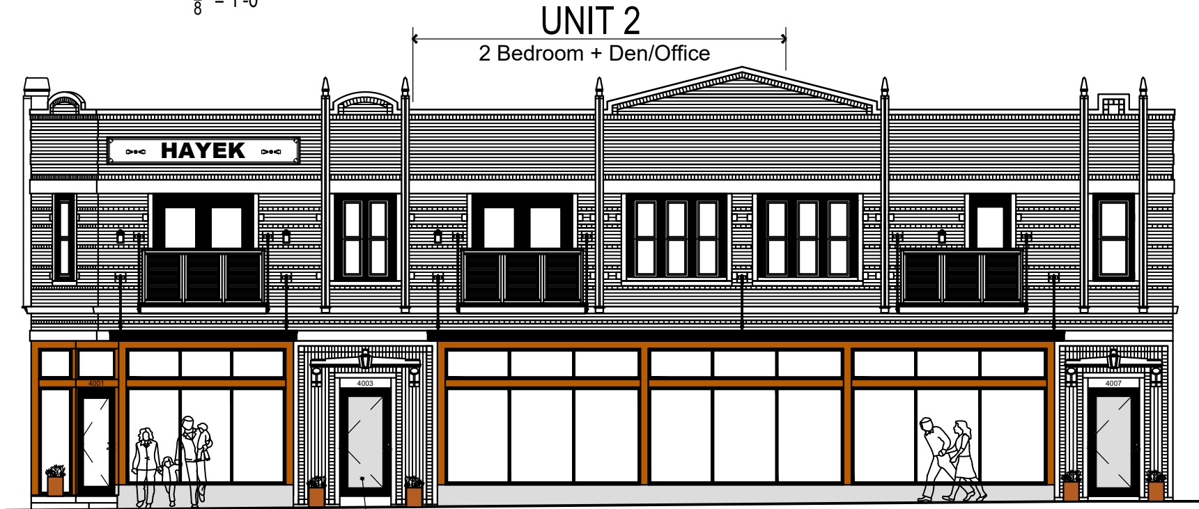
Downer Avenue (East Elevation)